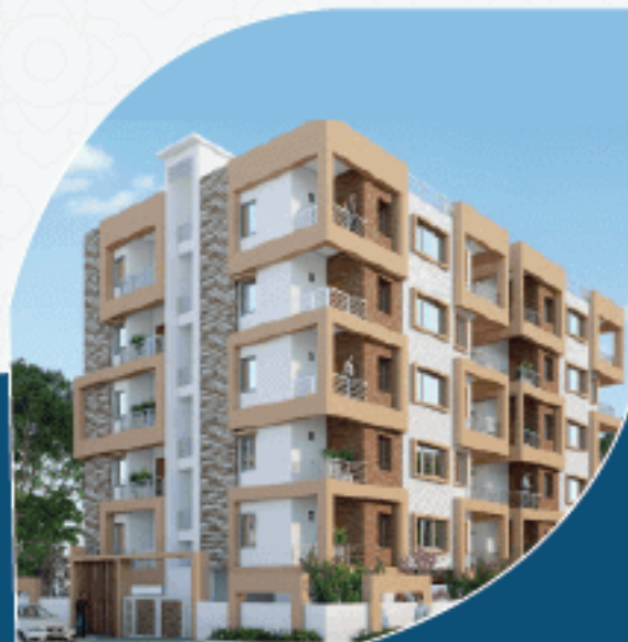
Nestcon Aster Kompally