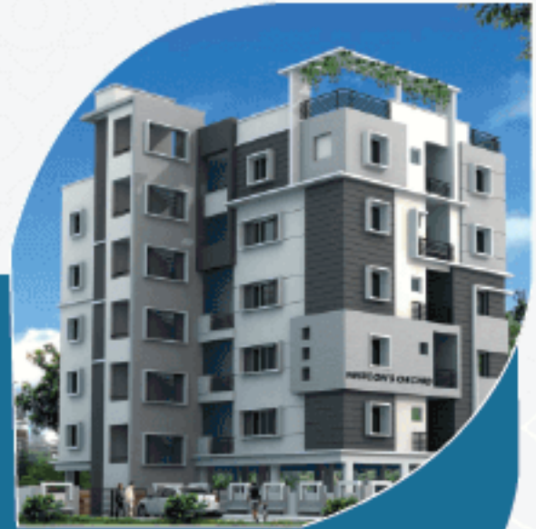
NESTCON Orchid Kanajiguda