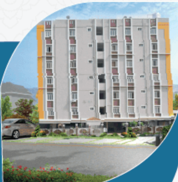
NESTCON Elegant Cove Hasmathpet