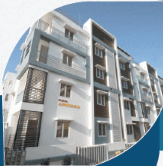
NESTCON Aishwarya Bangalore