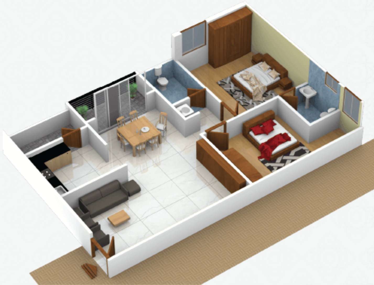
Flat - 5 [2 BHK-EAST FACING]